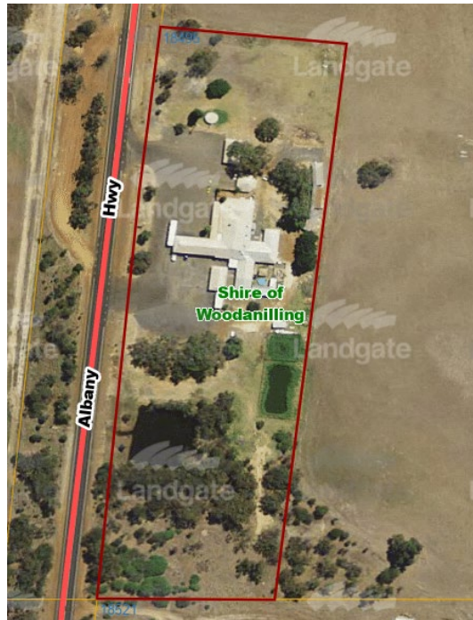
Figure 2 – Site location for Beaufort River Shell Service Station

A recent site visit by Shire Officers shows that the tank is already in place on a concrete structure. The applicant has advised that the tank is not yet in use, but development has commenced, therefore the application has become retrospective.