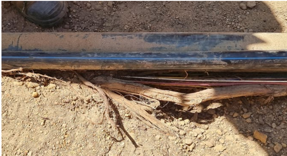
Figure 2: Water pipe, electrical cabling and tree root system.

A new trench was required to be dug and cut through the bitumen carpark and new cabling (now contained in conduit) has been laid from the pump shed to the oval edge to ensure the system was able to operate.