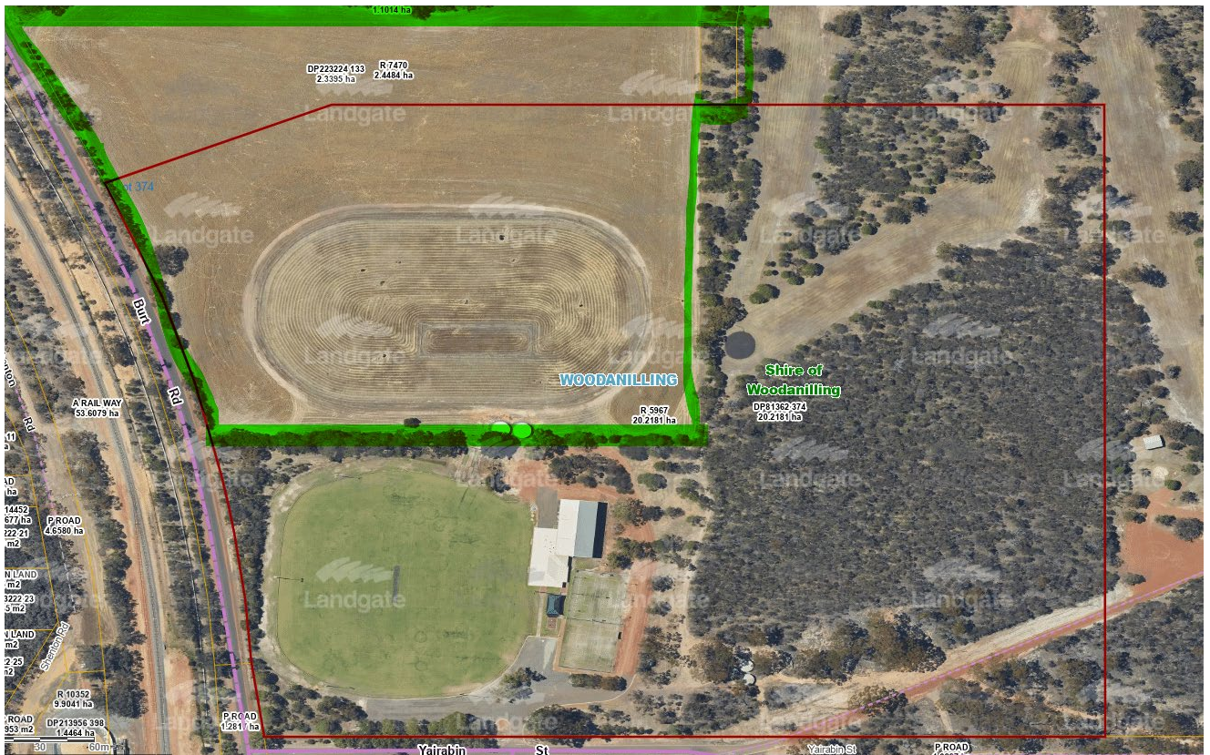
Figure 2. Site Location for Reserve 7470 and Part Reserve 5967

The land described is vested and held by the Shire for the purpose of Public Recreation with the power to lease for any term not exceeding 21 years, subject to the consent of the Minister of Lands. Reserve 7470 is 2.4483 hectare and zoned Park Land and Recreation. Part Reserve 5967 a whole site area of 20.2166 hectare which includes the Woodanilling Recreation Area with the zoning for the site as Recreation.