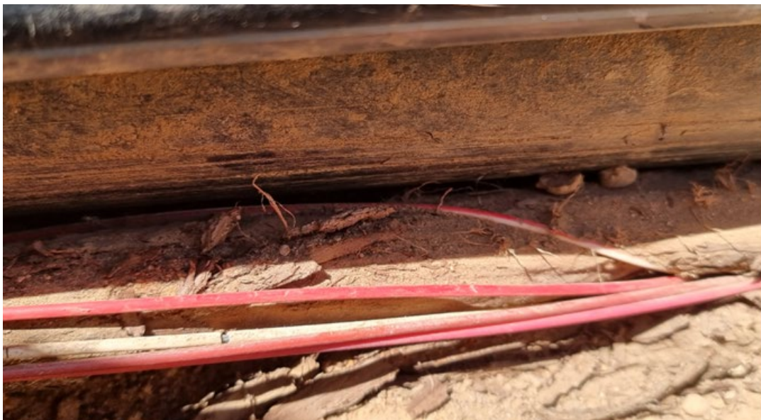
Figure 1: Existing cabling with tree roots.

The investigation identified the problem that the existing cabling, which was the original reticulation wiring had failed. It is at least 20 years or more old and evidence shows significant tree root damage to the cabling.