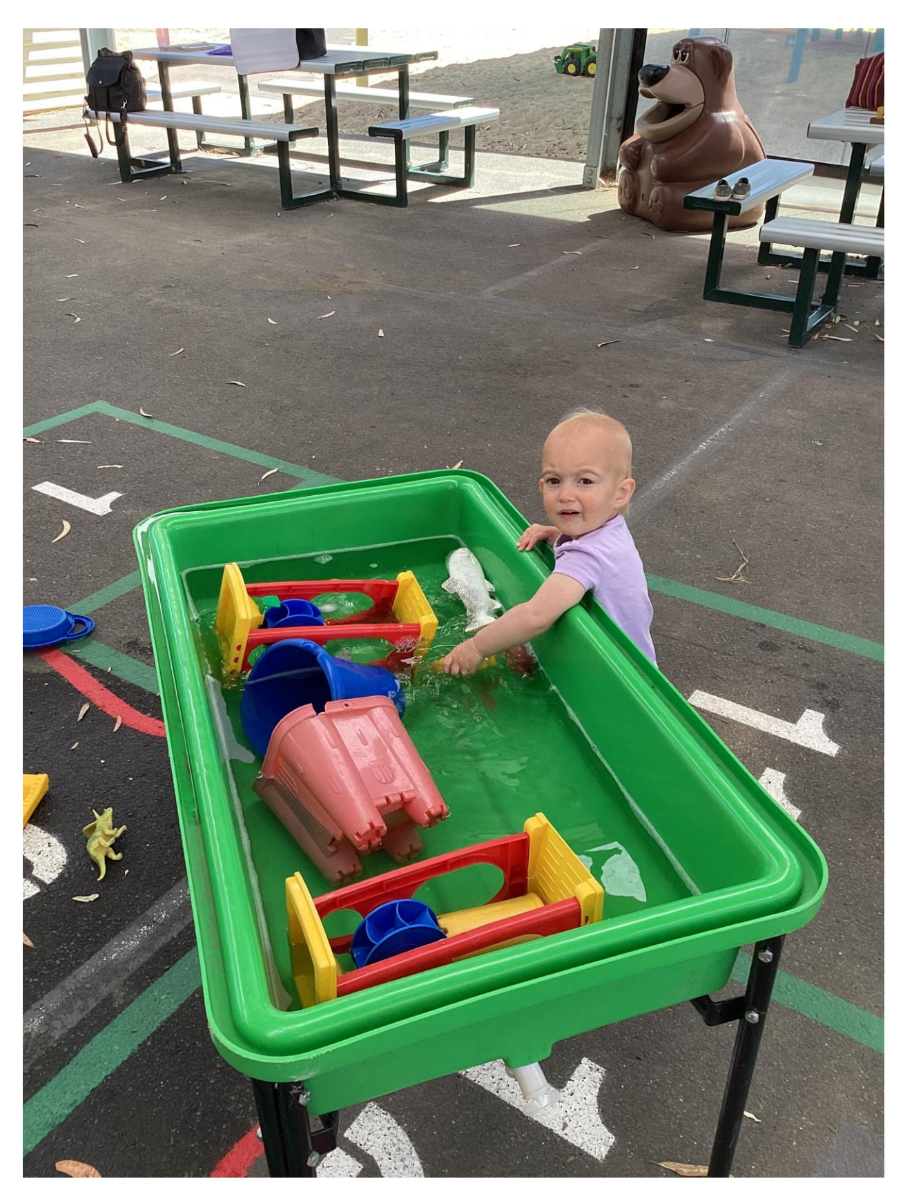
Skate Park Artwork