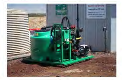
Batchmate - 800I

The Batchmate is portable, easy to use, and proven.